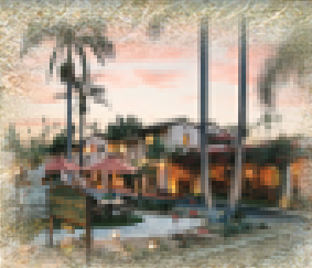
BRISAS DEL MAR INN AT THE BEACH