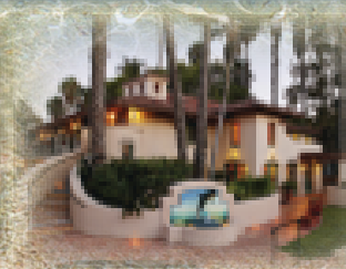
INN BY THE HARBOR

For best rates, ask for the "Club SB Rate"