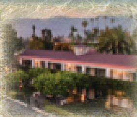
LAVENDER INN BY THE SEA