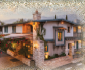
BEST WESTERN PLUS SANTA BARBARA